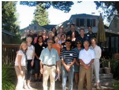
MPN patients gather after a support group meeting in San Francisco

The Foundation remains committed to educating patients through its free semi-annual newsletter, as well as assisting with coordination of patient support groups in the U.S. and abroad. In addition, the Foundation actively seeks to connect with physicians worldwide to provide the information and support they need for both clinical practice and patient support.